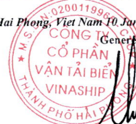
Duong Ngoc Tu