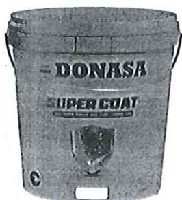
Sơn Super Coat - Sơn Nội thất Cao cấp