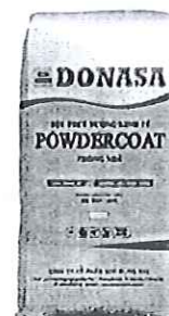
Bột trét Powdercoat