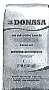
Bột trét Donasa