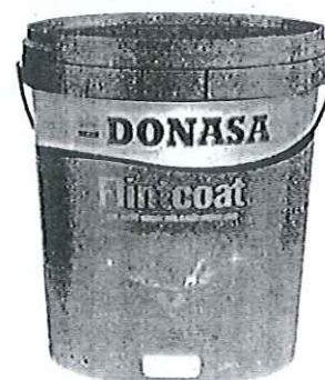
Sơn Flintcoat - Sơn ngoại thất Cao cấp