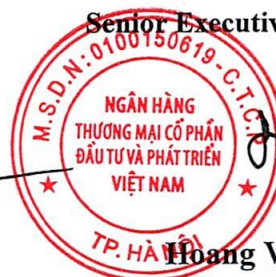
Hoang Viet Hung