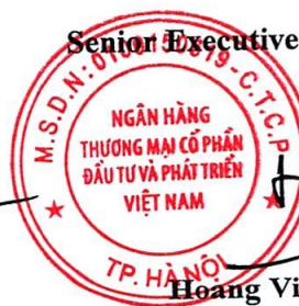
Hoang Viet Hung