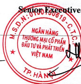
Hoang Viet Hung