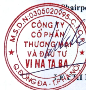
LE CHI LONG