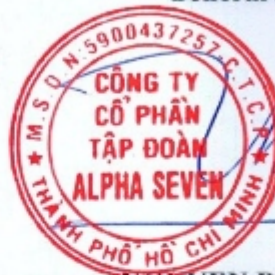
NGUYEN DINH TRAC