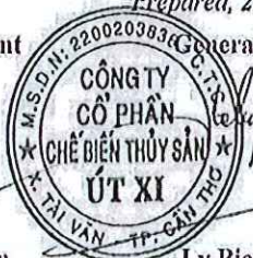
Ly Bich Quyen