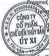
Ly Bich Quyen