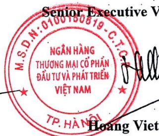
Hoang Viet Hung