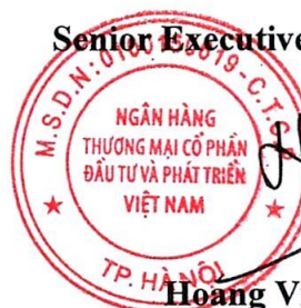
Hoang Viet Hung