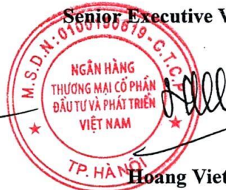
Hoang Viet Hung