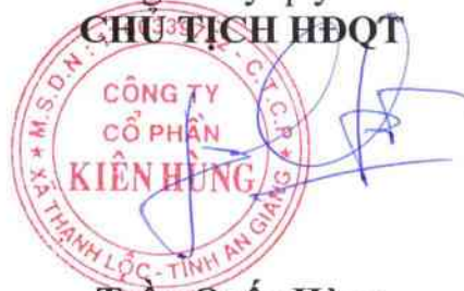
Trần Quốc Hùng