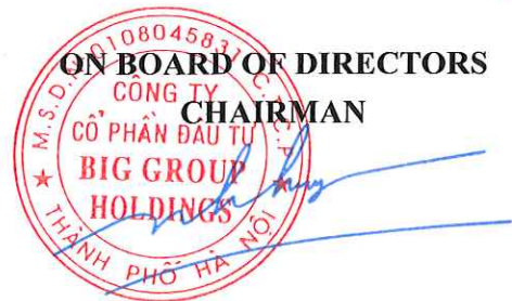
VO PHI NHAT HUY