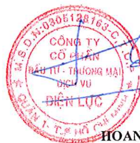
HOANG HUY HUNG